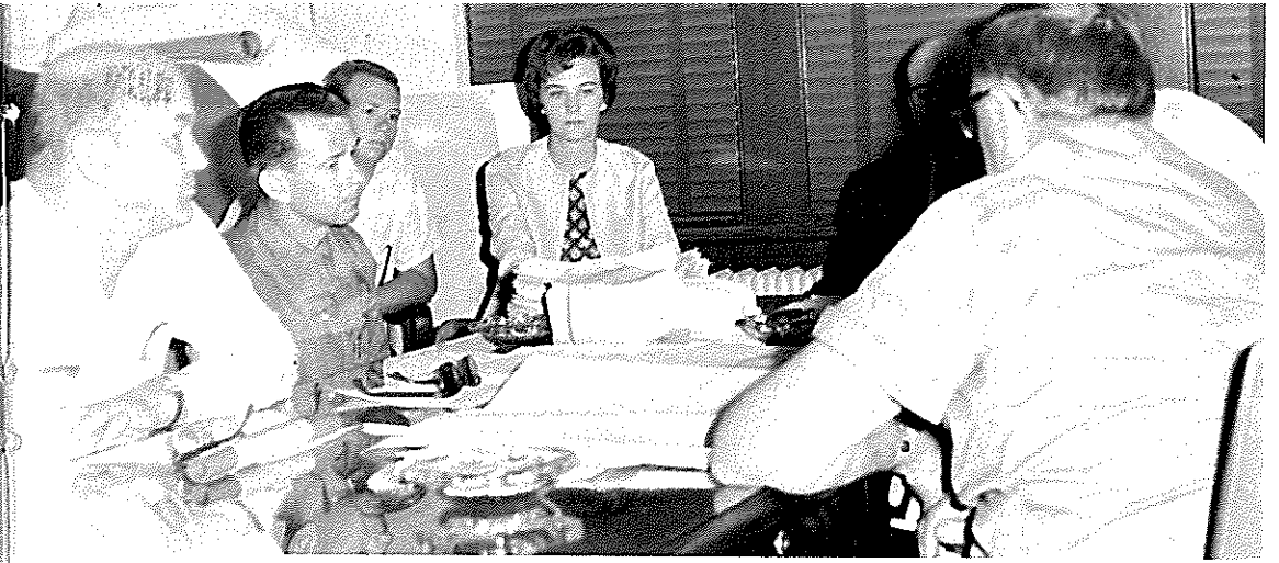
Commissioner's Court meets with students.